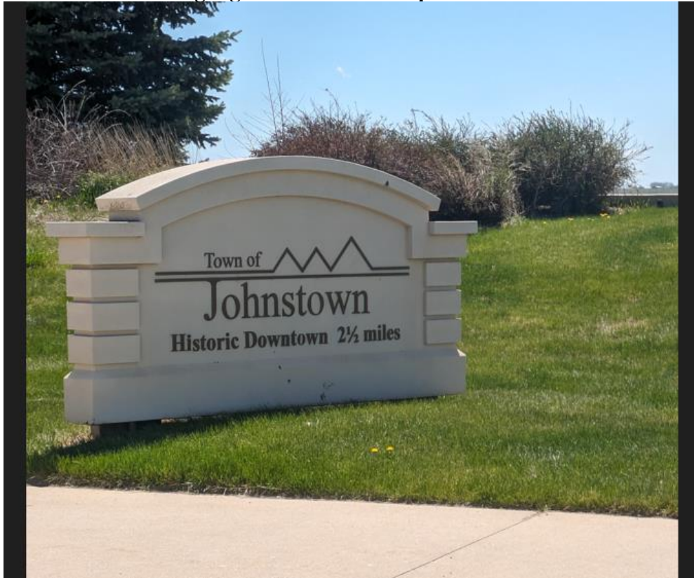
Current Monument Sign on Highway 60