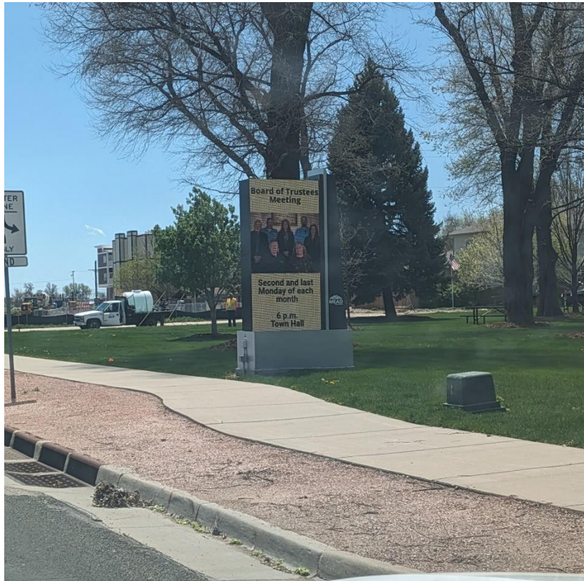
Monument Signage with LED